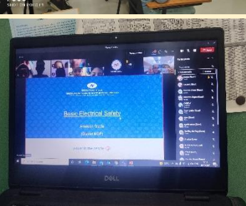
Information Corner- Upcoming CSR initiatives