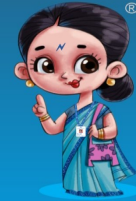
Roshni Tata Power-DDL's Corporate Mascot