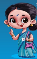
Roshni Tata Power-DDL's Corporate Mascot