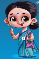
Roshni Tata Power-DDL's Corporate Mascot